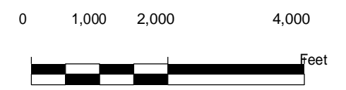
FIGURE 1 SITE LOCATION MAP

REFERENCE: 7.5 MINUTE U.S.G.S. TOPOGRAPHIC MAP OF INDIO, CALIFORNIA