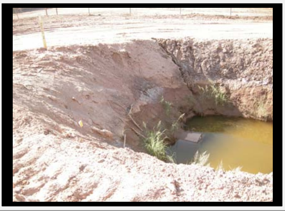
100 Meters Downstream 32°45'8.2"/115°36'15.3" NAD 83