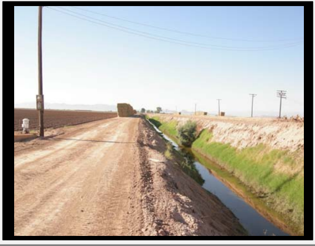
Project Site – 100 Meters Upstream 32°45'4.9"/115°36'11.0" (NAD 83)