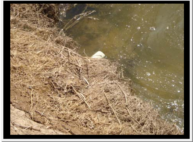
Discharge Area 32°45'8.1"/115°36'15.3" NAD 83