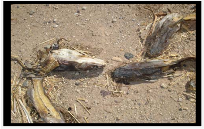
Catfish Found in Vicinity of Discharge