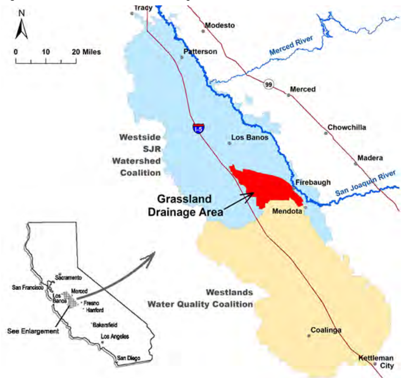
Figure 1 - Location of the Grassland Drainage Area

The Grassland watershed overlies the Delta-Mendota groundwater subbasin which consists of the Tulare Formation, terrace deposits, alluvium, and flood-basin deposits. The Grassland Drainage Area primarily overlies the Tulare Formation. The primary aquifer system occurs in unconsolidated alluvial and continental deposits of the Tulare Formation. The Tulare Formation is composed of beds, lenses, and tongues of clay, sand and gravel that have been alternately deposited in oxidizing and reducing environments. The Corcoran clay of this formation underlies the basin at depths ranging from 100 to 500 feet and acts as a confining bed.