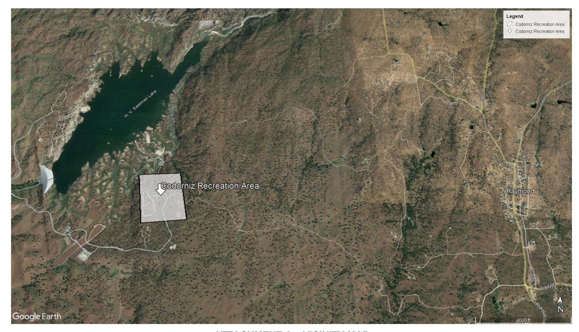
ATTACHMENT A - VICINITY MAP

NOTICE OF APPLICABILITY 2014-0153-DWQ-R5399 Drawing Reference: Google Earth