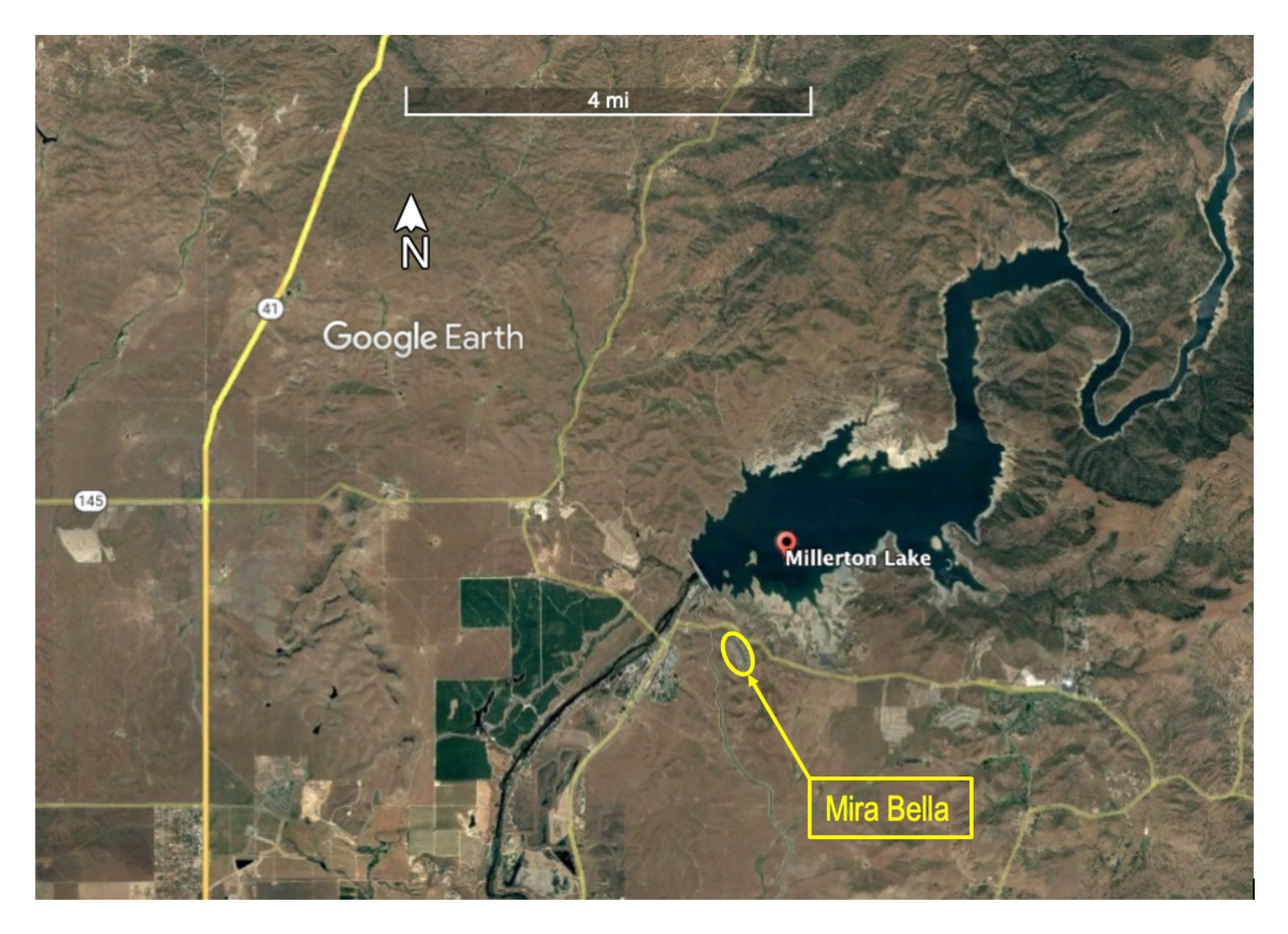
ATTACHMENT A - SITE LOCATION MAP

NOTICE OF APPLICABILITY 2014-0153-DWQ-R5379 Drawing Reference: Google Earth