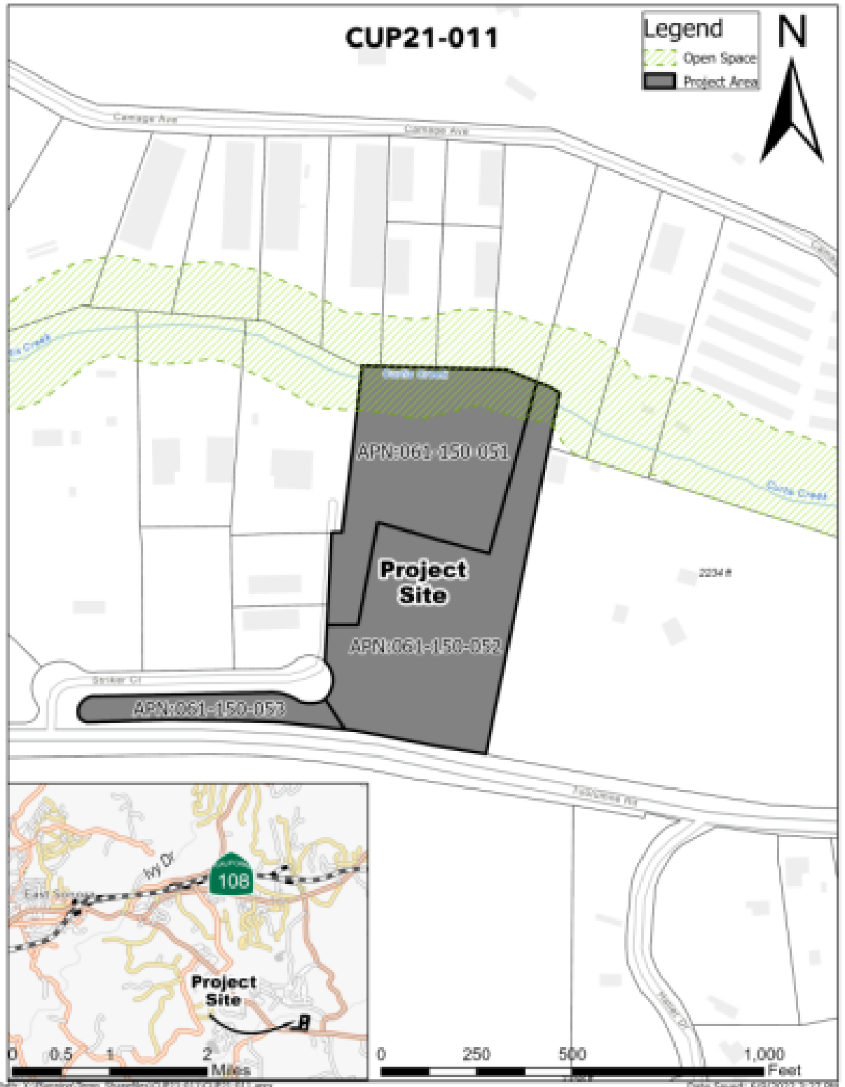
Figure 1: Site Location Map