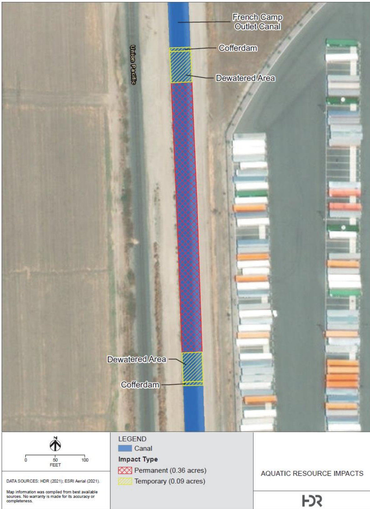
Figure 2: Project Impacts Map