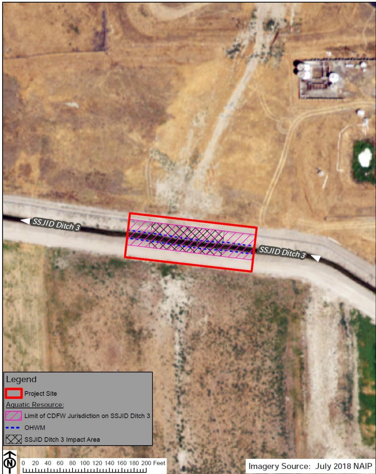
Figure 2: Project Impacts Map