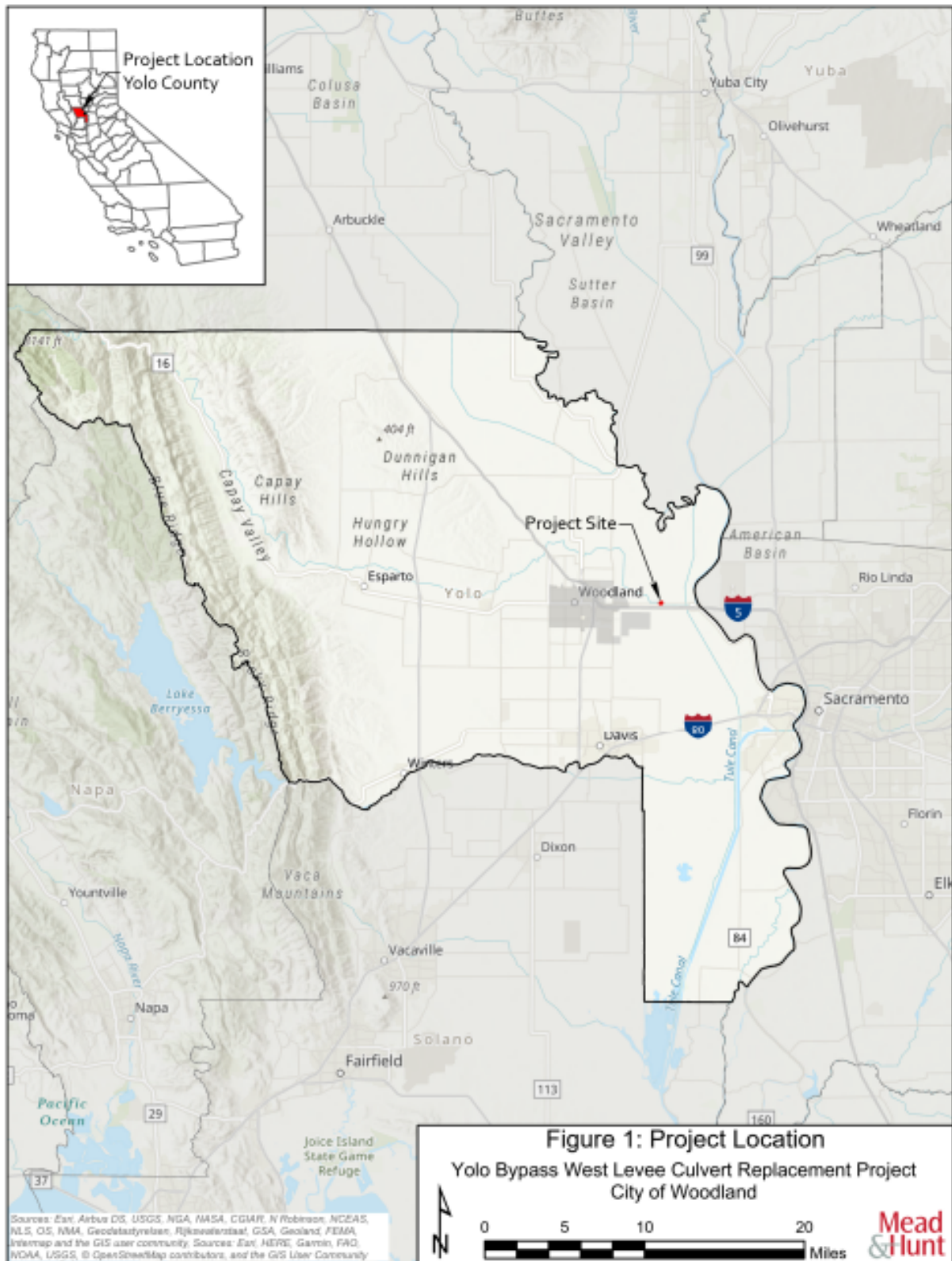
Figure 1 - Site Location Map