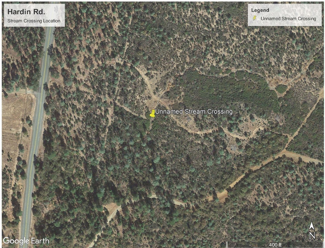
Figure 3. Stream Location.