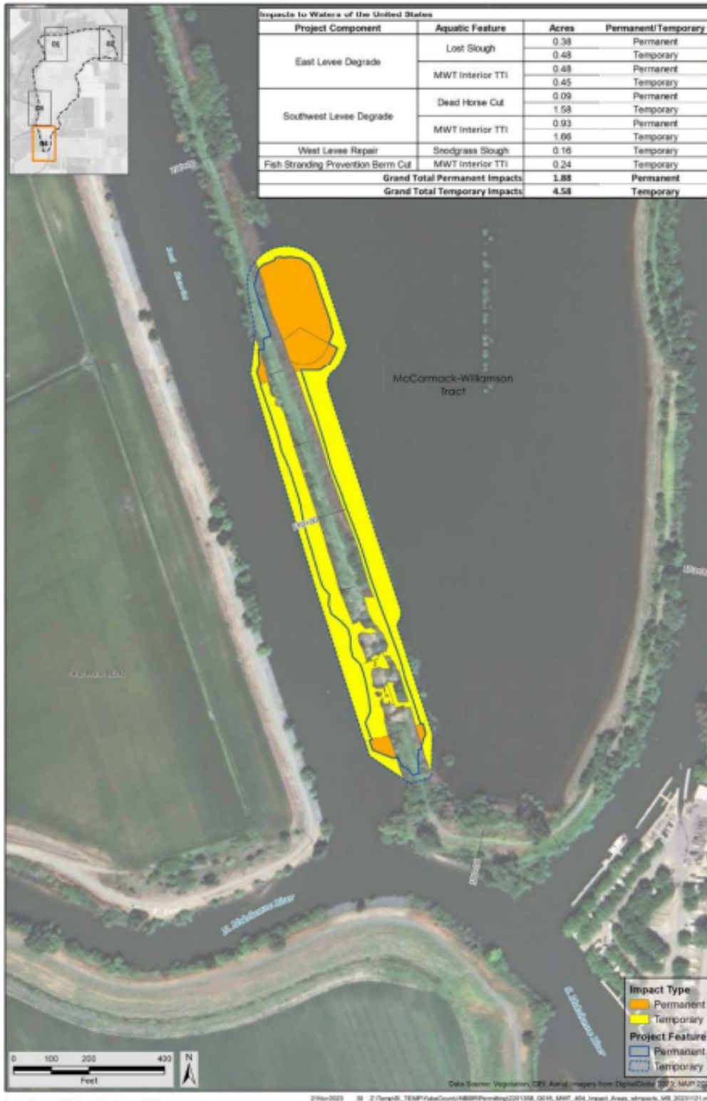
Figure 4 – Impacts of Southwest Levee Degrade