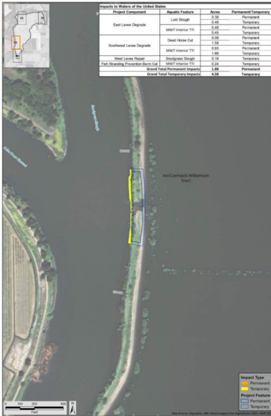
Figure Source: GEI Consultants, Inc. 2023.