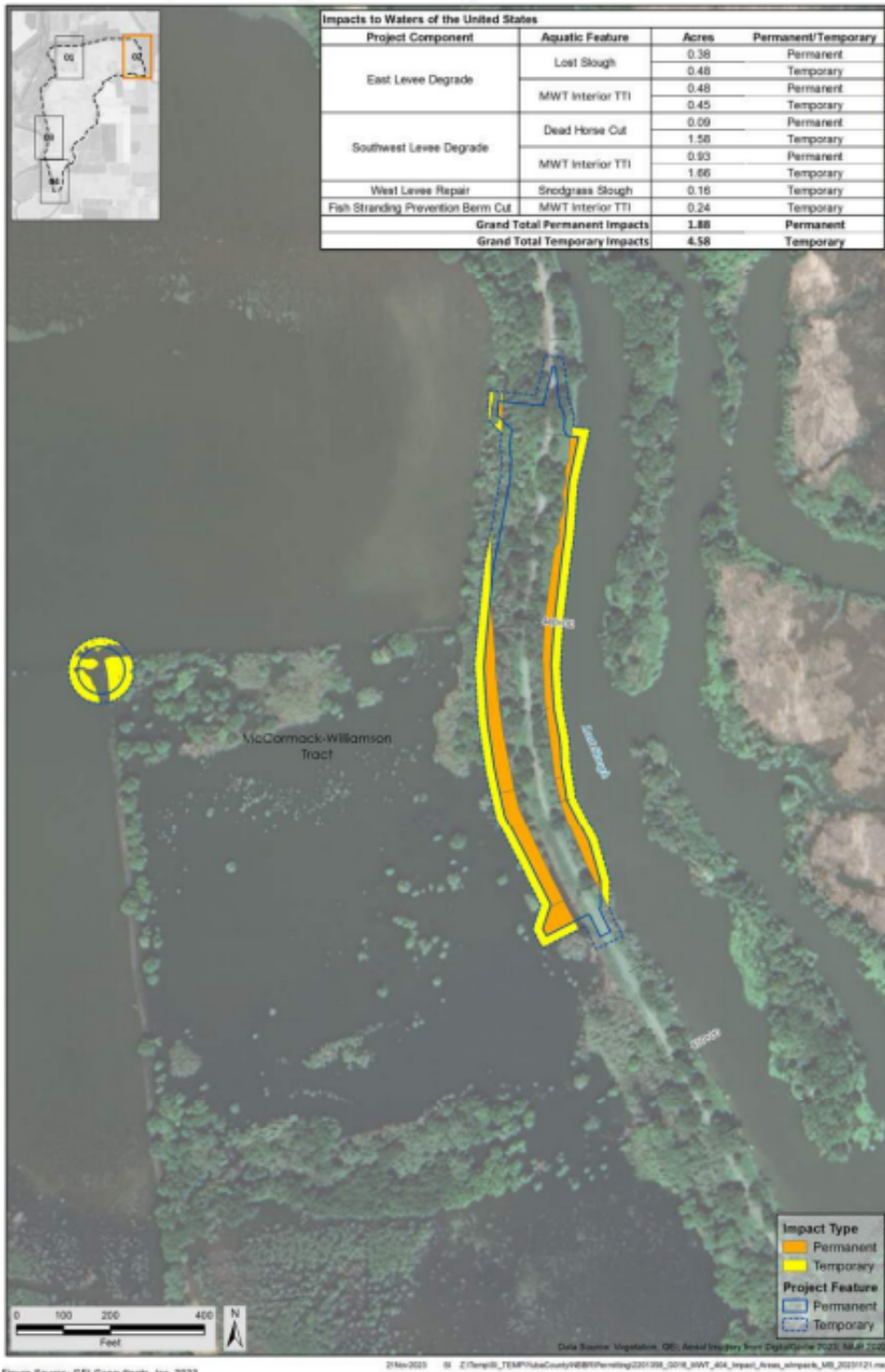
Figure 3 – Impacts of East Levee Degrade