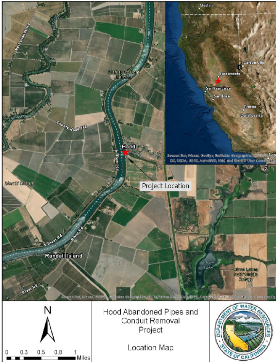
Figure 1: Project Vicinity Map