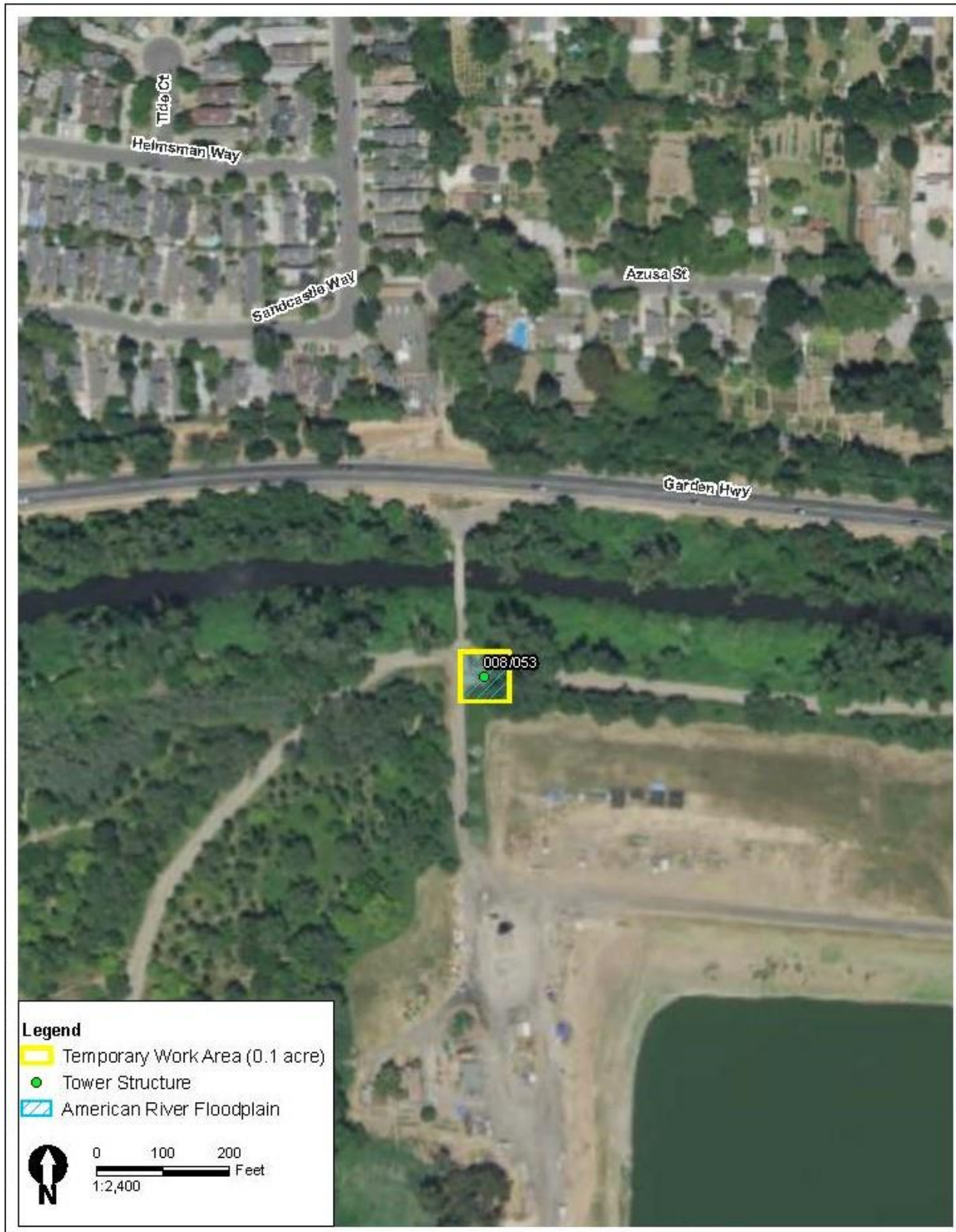
Figure 3: Impacts to Wetlands at Tower 008/053