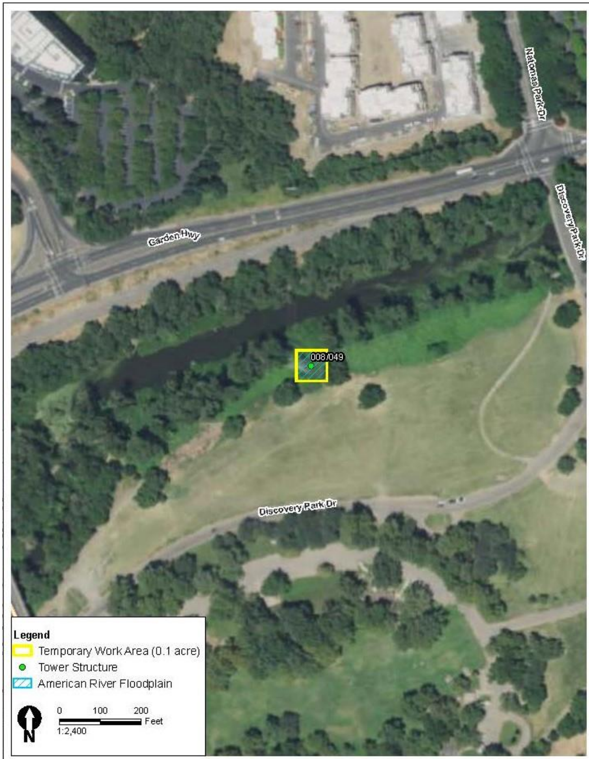
Figure 2: Impacts to Wetlands at Tower 008/049