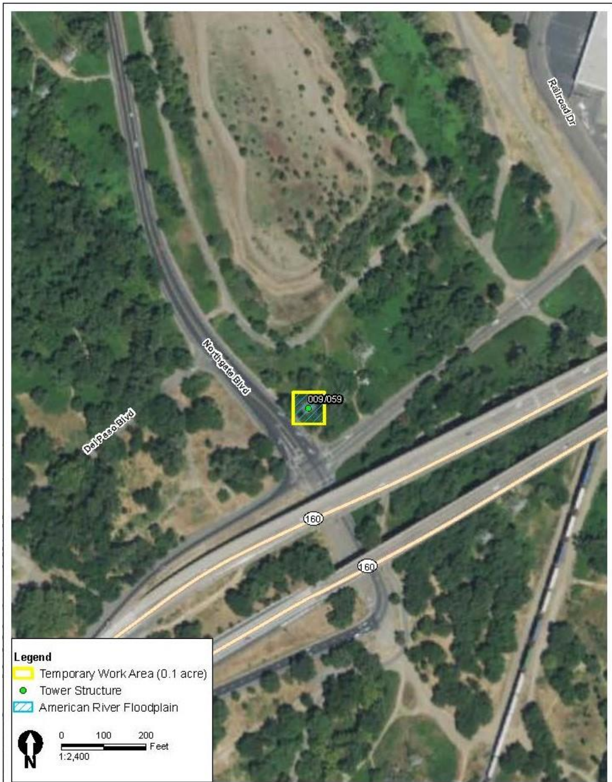
Figure 4: Impacts to Wetlands at Tower 009/059