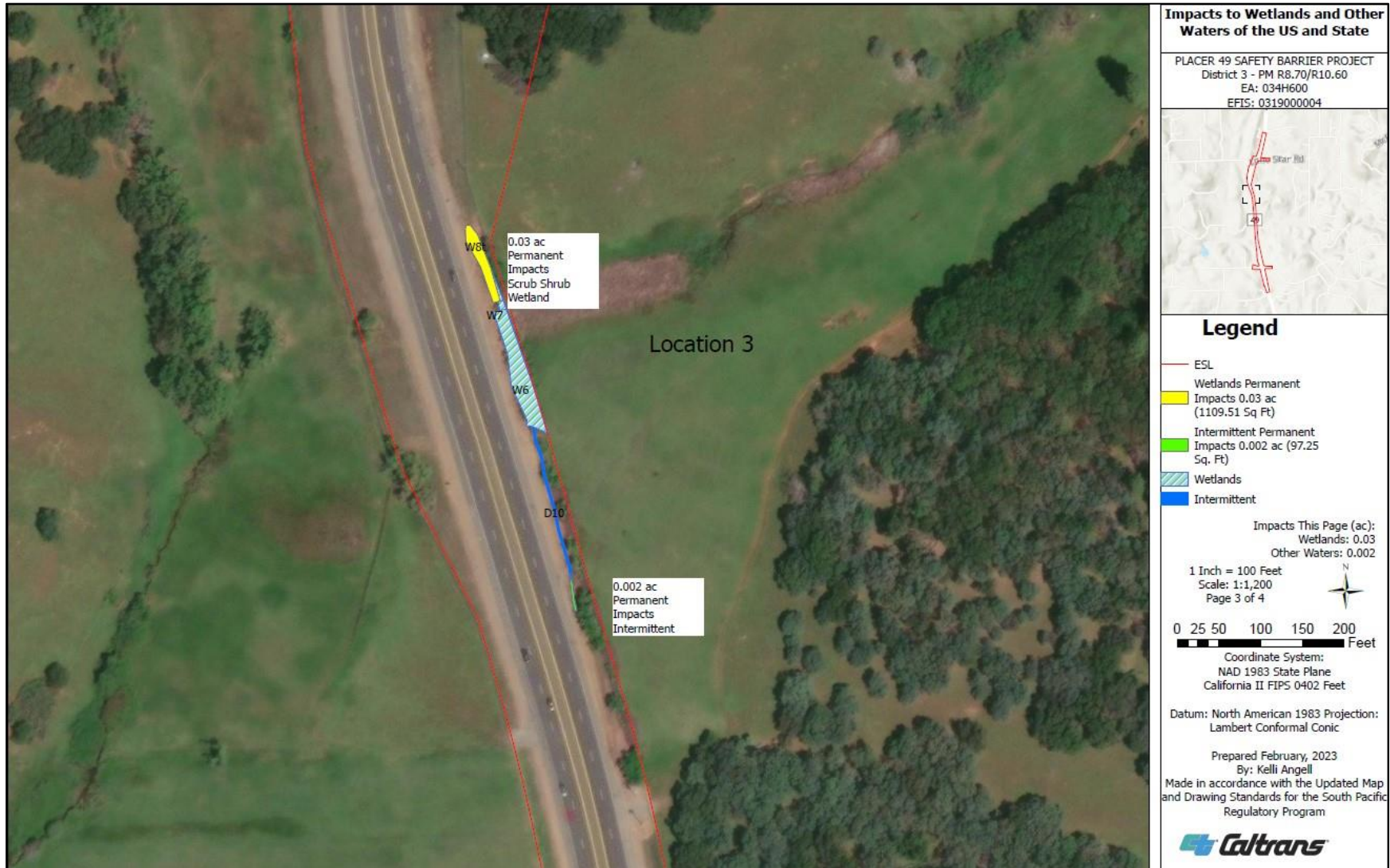
Figure 4: Project Impacts Map Location 3