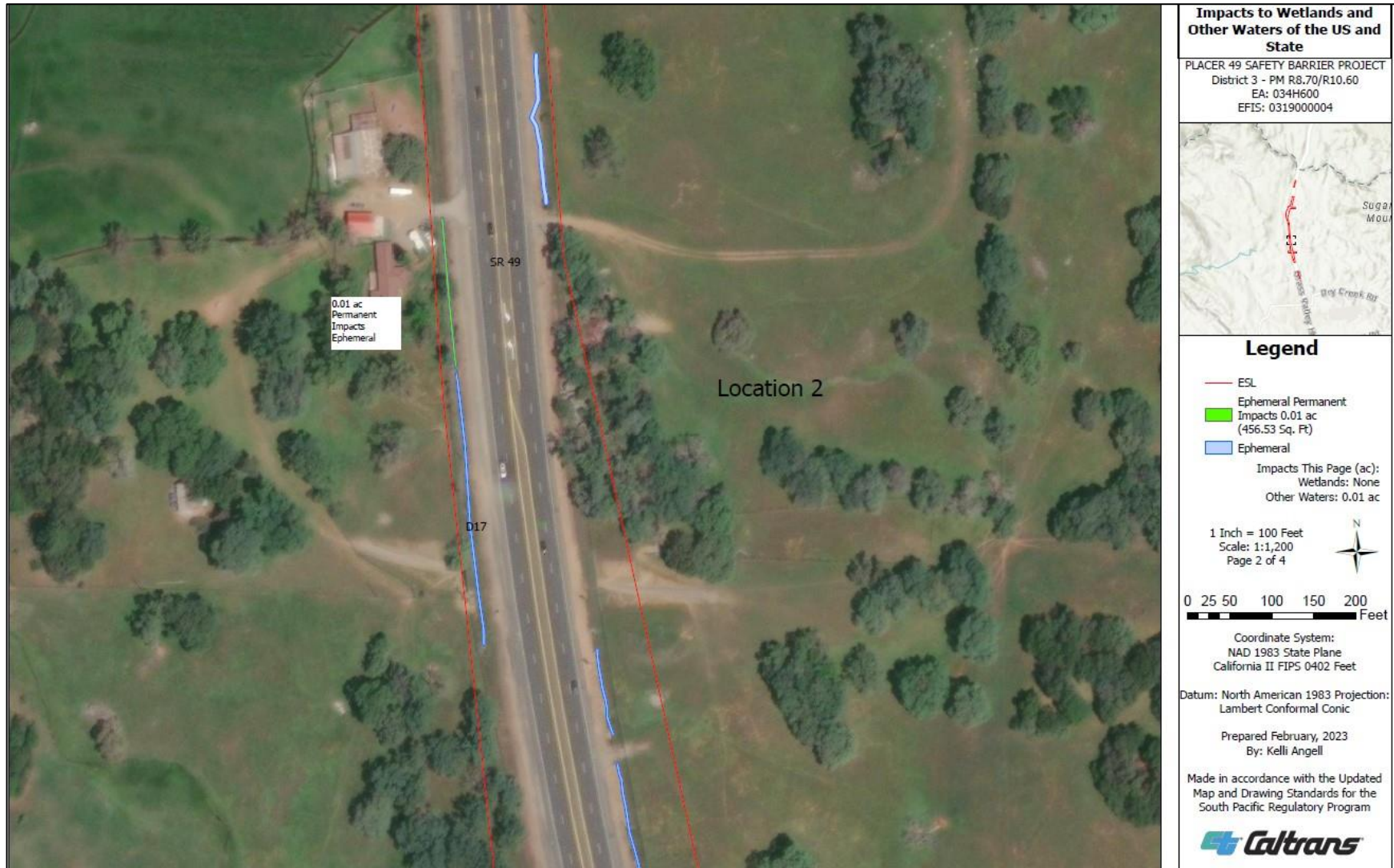
Figure 3: Project Impacts Map Location 2