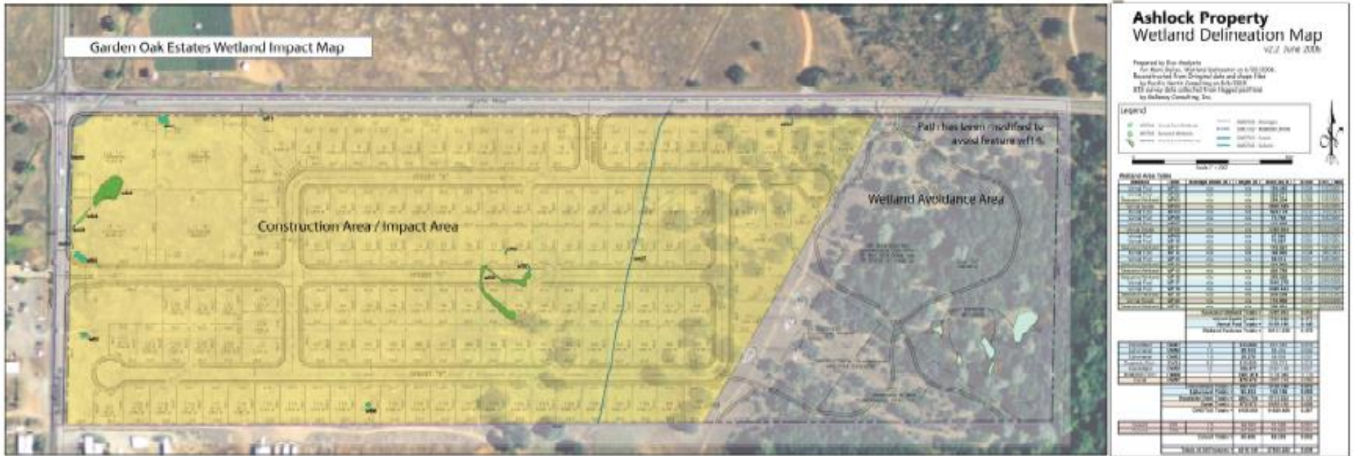
Figure 3: Waters of the United States Impacts