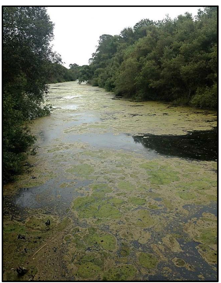
Algae mats, lower Pajaro River, July 2015