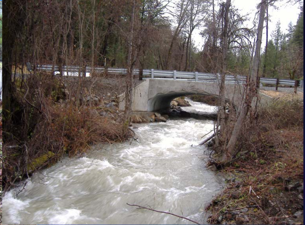
Soldier Ck at Evans Bar. Left: Feb 2004.